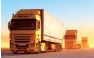
Heavy Duty On and Off Road