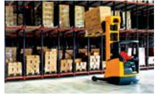
Material Handling Equipment