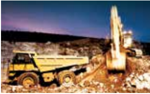
Mining and Construction