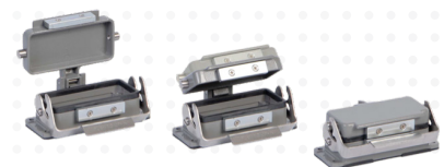
When the spring closes the cover, magnets tightly squeeze the cover closed. The result is an automatic IP66 seal that reaches a full IP69 seal when the lever is locked

To learn more www.molex.com/ab/gwconnectautocover.html