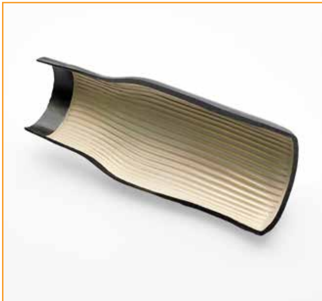
Cross Sectional Area