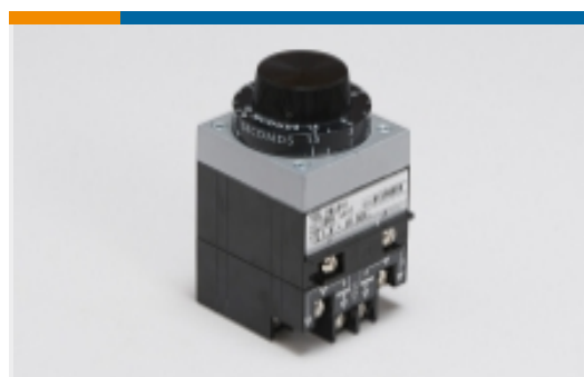
Time Delay Relays(16)